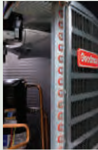
Goodman's SMARTCOIL 5mm tube condensing coil design optimizes the heat transfer ability of R-410A refrigerant compared to standard 3/8" copper tubing.

You can count on your Goodman brand GSX13 Air Conditioner to keep you cool on even the hottest summer days. Your Goodman brand air conditioner starts with an energy-efficient compressor, which operates in tandem with our high-efficiency coil. The coil is made of rifled refrigeration-grade copper tubing and corrugated aluminum fins in a design that maximizes surface area. These high-quality components together cool your home effectively.